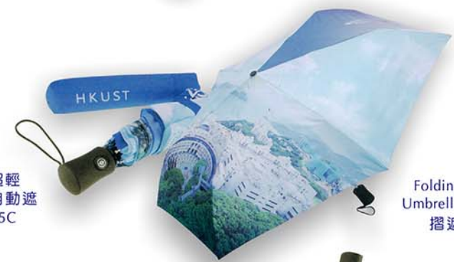
彩印超輕 摺合自動遮 UM-215C