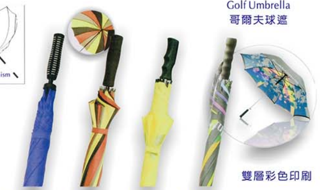
*UM-407 UM-105 UM-402 UM-450