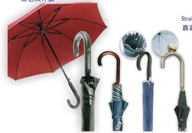
U117 U101 U108 U114