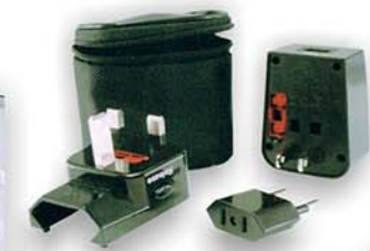
AD-104 Universal Travel Socket