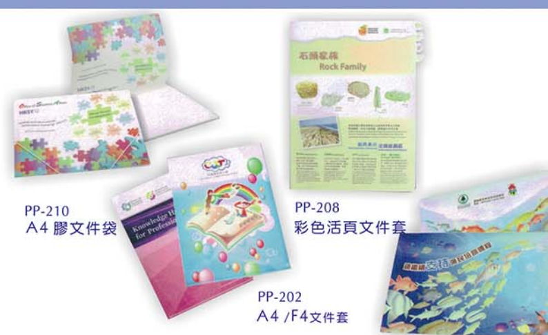
PP-210 A4 膠文件袋