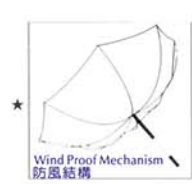
Wind Proof Mechanism 防風結構