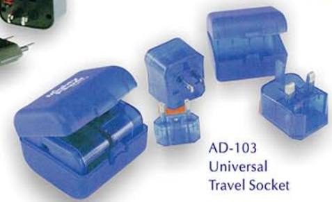
AD-103 Universal Travel Socket